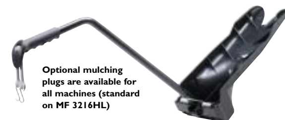
Optional mulching plugs are available for all machines (standard on MF 3216HL)