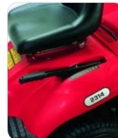
Simple lever adjustment for 7-position cutting height (MF 2314 shown)

Below: MF 3320HE. 1220 mm cut, with timed (overlapping) blades and scalp rollers