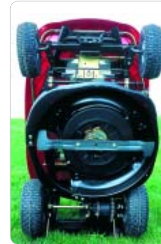
MF 2107 cutting deck. Single, high speed blade.