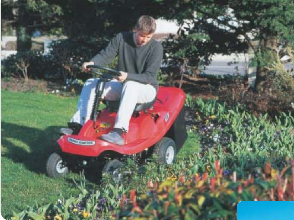
Left: MF 2107. 630 mm cut and 140 litre collection. Small, compact and highly manoeuvrable