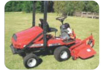
MF 420 FC