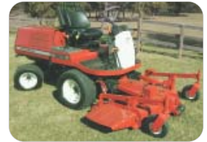
MF 430 FC

Every effort has been made to ensure that the information contained in this publication is as accurate and current as possible. However, inaccuracies, errors or omissions may occur and details of the specifications may be changed at any time without notice. Therefore, all specifications should be confirmed with your Massey Ferguson Dealer or Distributor prior to any purchase.